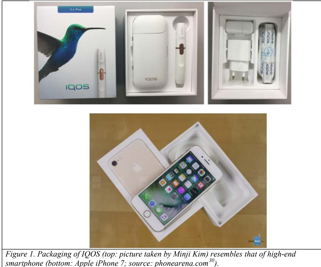
Figure 1. Packaging of IQOS (top: picture taken by Minji Kim) resembles that of high-end smartphone (bottom: Apple iPhone 7; source: phonearena.com 30 ).

and that adolescents will find these flavors appealing and therefore more likely to be used by them.