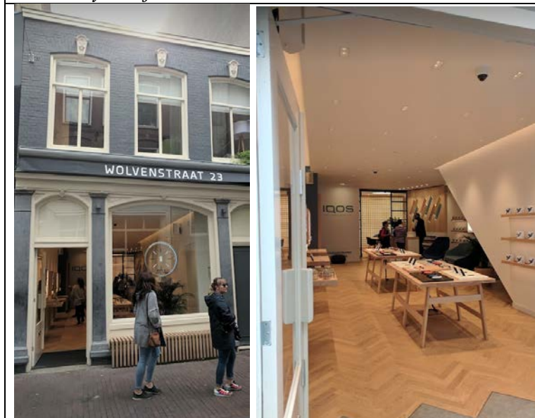
Figure 3. IQOS Flagship store in Amsterdam, Netherlands, September 2017.